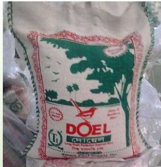
Our Buyer's Brand